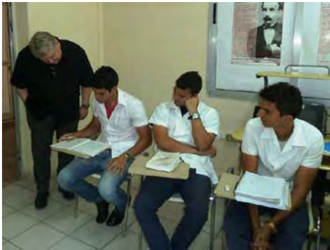
Prof Rich Roberts with Cuban medical students

The Congress was an overwhelming success. There were more than 1000 registrants, with 80% visitors from 24 countries. The Brazilians attended in great numbers, representing more than half the foreign guests and most of the poster presentations. The meeting included a heartening number of younger doctors, as well as an inspiring meeting of the leaders of the Waynakay Movement of young family doctors. The conference was just the right mix of science and socializing, learning and laughter.