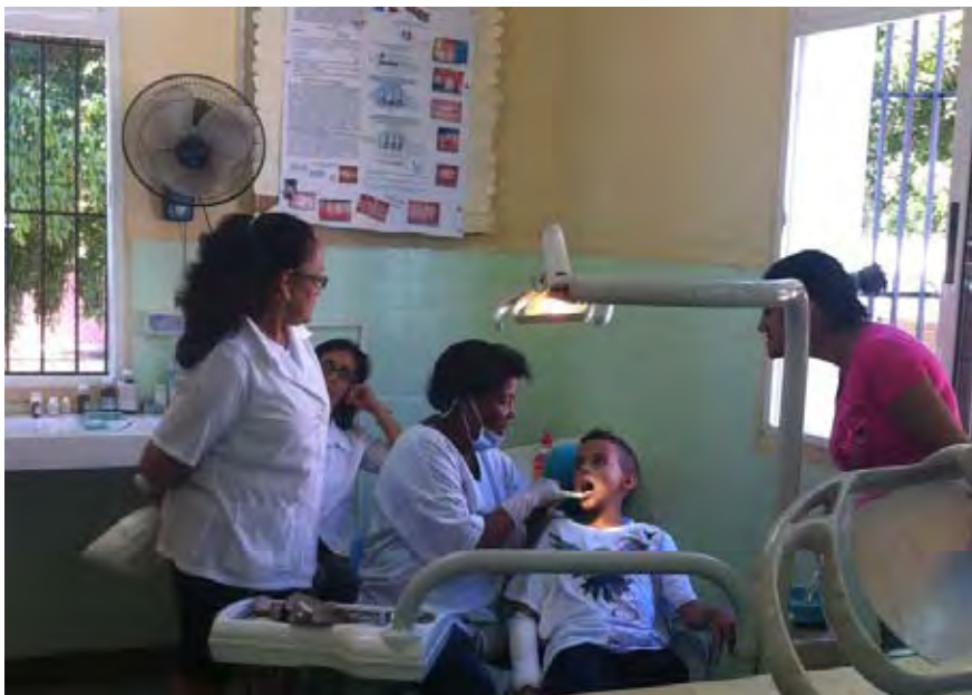
Dental clinic in polyclinic

Health care is also an important part of Cuban foreign policy. There are about 30,000 foreign students studying in Cuban medical schools, with about 10,000 from 29 countries at the Escuela Latino American de Medicina (ELAM). Cuba also sends numerous brigades of doctors and nurses to multiple countries. The shift to family medicine began in earnest after the system was rebuilt