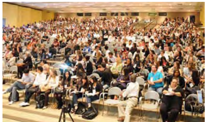
Some of the meeting participants

More than 300 speakers were invited, 30 of them from 11 different countries (Portugal, Canada, Australia, United States, Spain, United Kingdom, Germany, South Africa, Paraguay, Italy, Argentina). Pharmaceutical industry sponsorship was not accepted and the meeting had a high standard of quality in organisation, scientific and cultural aspects. It was funded exclusively by those who attended the meeting (70% of the expenses) and by the Ministry of Health (30%).