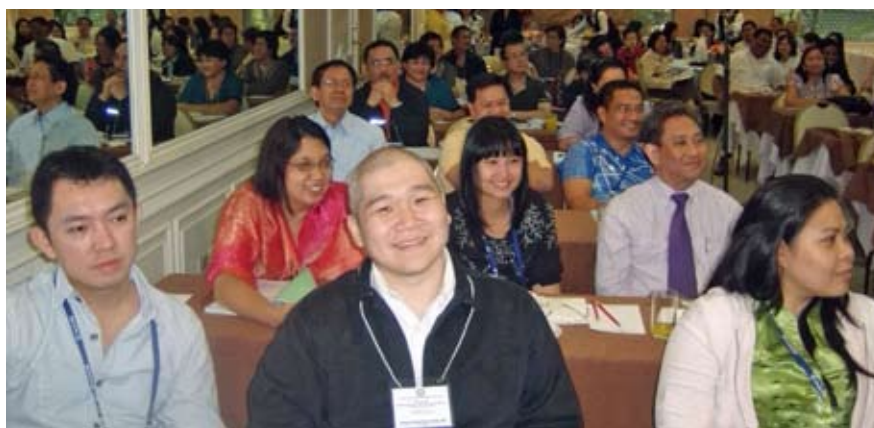
A younger generation of PAFP members at the strategic planning workshop in November 2010