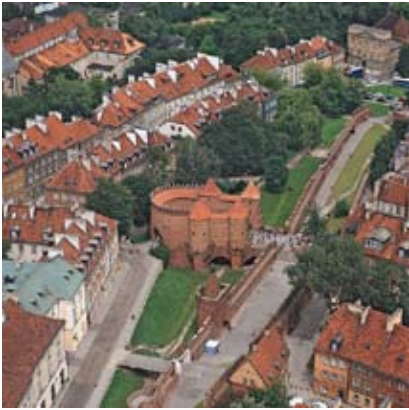
Warsaw- old town

The highest building in Warsaw and Poland is the Palace of Culture and Science built, in 1955, in the social realistic style, is a gift from the Soviet Union. It fulfils the role of a cultural centre accommodating theatres, museums, a cinema and a concert hall. The highest viewing platform in Warsaw, on the 30th floor, offers an excellent panoramic view of the city.