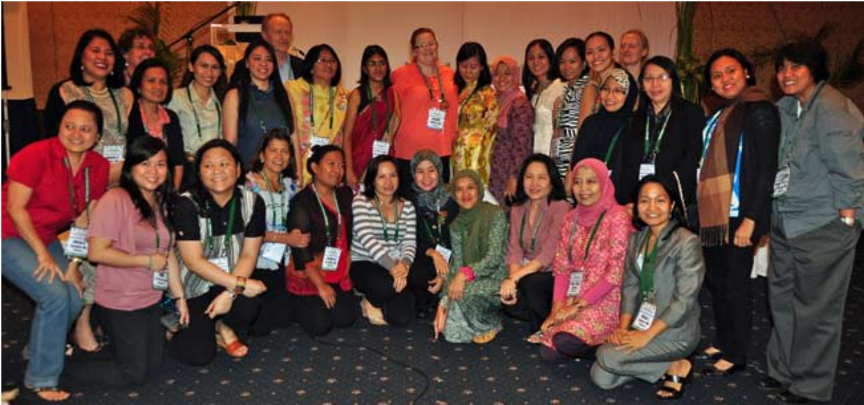
WWPWFM workshop group squeeze together for a photo in Cebu

physicians, how we can be the best and most effective we can; and the other on the health of our female patients. The two are, of course, intertwined. But at the Cebu workshops, I detected a shift in interest – a broader view of women’s health, and how gender issues influence this in a range of ways, and what we as women physicians can do about this.