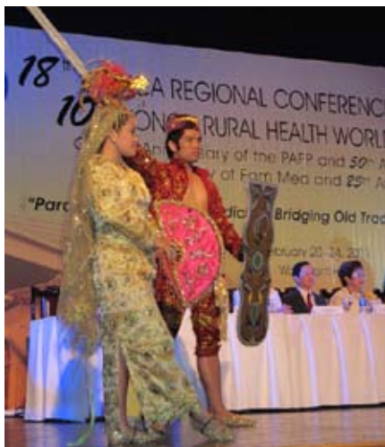
Dancers at the opening ceremony