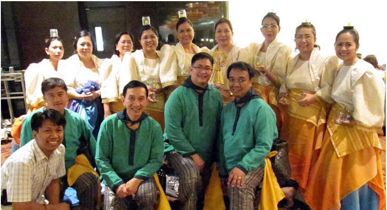
Doctors from Pangasinan chapter ready for their dancing performance at the golden anniversary dinner