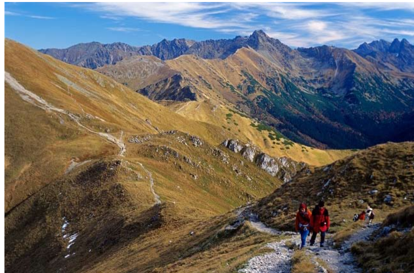
Beauty of the Tatras

Recorded on the UNESCO Biosphere Reserves list, the Tatra National Park encompasses both the Polish and Slovakian parts of the range. Tourist trails lead hikers to mountain lakes, waterfalls and caves as well as through scenic mountain valleys. The mountains are home to chamois, bears, and marmots.