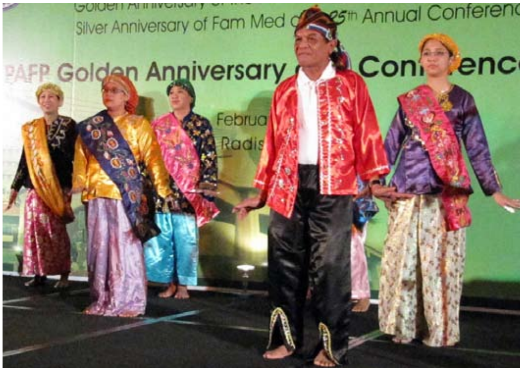
Doctors from Zamboanga chapter entertain the crowds with their traditional dance