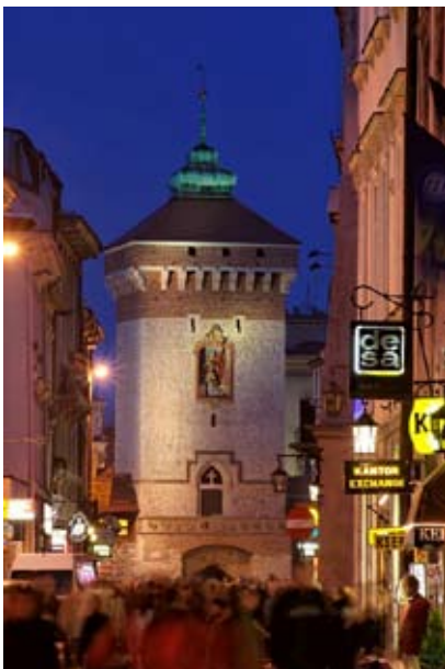
Cracow – historical capital

Cracow, Poland’s former royal capital, is one of the most attractive spots on the tourist map of Europe. The city, which lies on the banks of the Vistula River, is famous for its priceless historical monuments of culture and art. Every visitor to Cracow should see Europe’s largest medieval market square, the royal castle, the Wawel cathedral with its outstanding renaissance chapel, and the medieval university building of Collegium Maius with its unique collection of astronomical instruments. The Jewish quarter of Kazimierz features a wealth of Jewish heritage with its 16th century cemetery and seven synagogues of which one is now the Jewish museum.