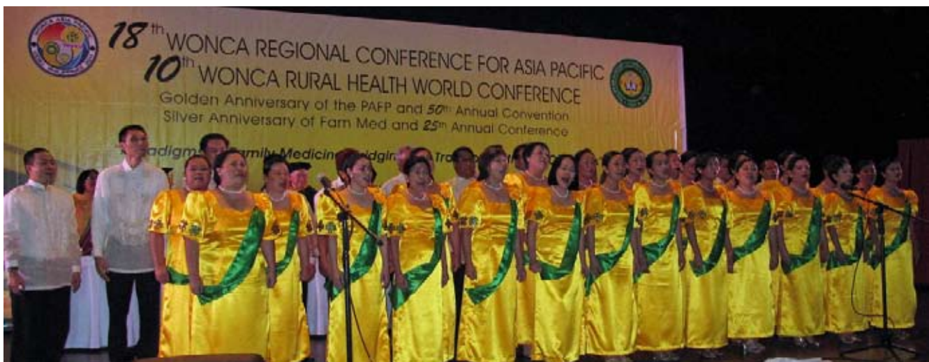
Doctors from the Iloilo chapter choir sing at the opening ceremony.