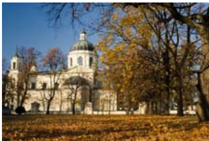
Warsaw- Wilanów park-place complex

The highest building in Warsaw and Poland is the Palace of Culture and Science built, in 1955, in the social realistic style, is a gift from the Soviet Union. It fulfils the role of a cultural centre accommodating theatres, museums, a cinema and a concert hall. The highest viewing platform in Warsaw, on the 30th floor, offers an excellent panoramic view of the city.