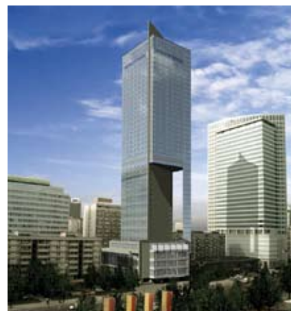
Warsaw – a modern city

A city to spend several days in, to get to know its character, discover the extraordinary history of the capital of Poland and surrender to its unique atmosphere... Totally destroyed during WWII, the Old Town and the Royal Castle were reconstructed and are now on the UNESCO World Cultural Heritage list. Walking the streets of the Old Town and New Town allows you to rest from the bustle of central city life. Atmospheric alleys, squares, and cosy cafés create a unique sense of history. The Old Town square lined with burgher houses, the Royal Castle, the Barbican and the gothic St John's Cathedral are all very popular with tourists. Visitors will also find many churches and palaces, including the Holy Cross church (with the urn containing the heart of Frederick Chopin).