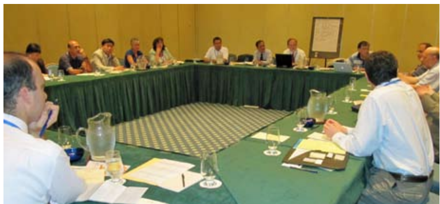
Wonca Working Party on Research meets in Cancun