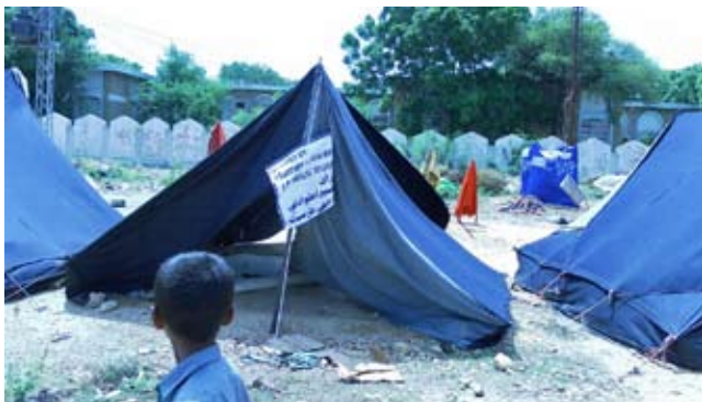
Make-shift camp for displaced people in Pakistan