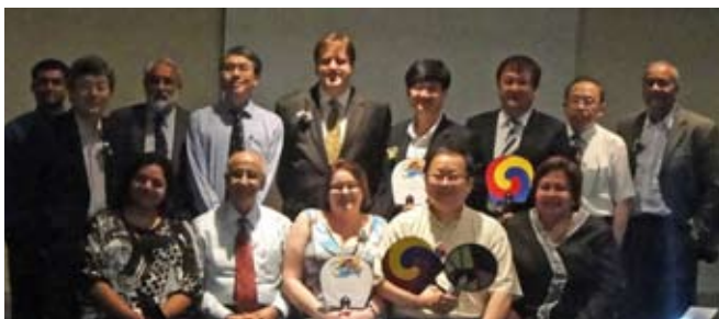
WONCA Asia Pacific Region council representatives in Cancun

The goals for the next triennium are to assist the remaining non-member organizations in the region to become members. These include Cambodia, Laos, Brunei, East Timor, the Pacific Nations and Papua New Guinea. I would appreciate help from member organizations who have connections to these countries to let me, and your APR council, know how we could help.