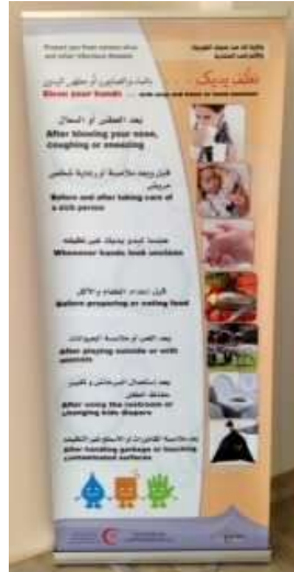
foto: Campaña de salud pública en Omán destinada a prevenir la propagación del Síndrome Respiratorio-coronavirus (MERS) en Oriente Medio.

La nueva estrategia nacional de atención primaria ofrece la oportunidad de fortalecer aún más el sistema de salud de Omán para satisfacer las necesidades actuales y futuras de la comunidad y permite continuar el desarrollo de alta calidad, seguros y servicios de atención primaria basada en la evidencia, garantizando estos servicios centrados en la persona e integrados en todo el sistema de salud.