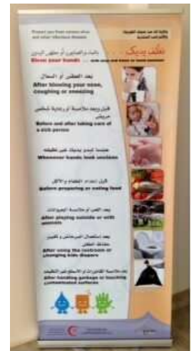
Photo: Public health campaign in Oman aimed at preventing the spread of Middle East Respiratory Syndrome-coronavirus (MERS)

The new national primary health care strategy provides the opportunity to further strengthen the health system in Oman to meet current and future community needs. It enables Oman to continue to develop high quality, safe, evidence-based primary care services and ensure these services are person-centred and integrated across the health system. It continues the training of a skilled workforce of caring, competent, compassionate and trustworthy health care professionals who are accessible and well supported in their important roles. And it ensures the safety and quality of primary care services to the people of Oman through the provision of excellent practices and