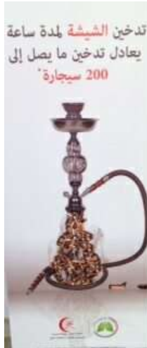
Photo: Public health campaign in Oman on the health risks of smoking a

shisha ("hubbly bubbly"), which can be the equivalent of smoking up to 200 cigarettes