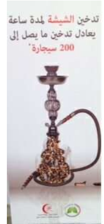
foto: Campaña de salud pública en Omán sobre los riesgos para la salud de fumar una "shisha" (pipa de agua), que puede ser el equivalente a fumar hasta 200 cigarrillos.