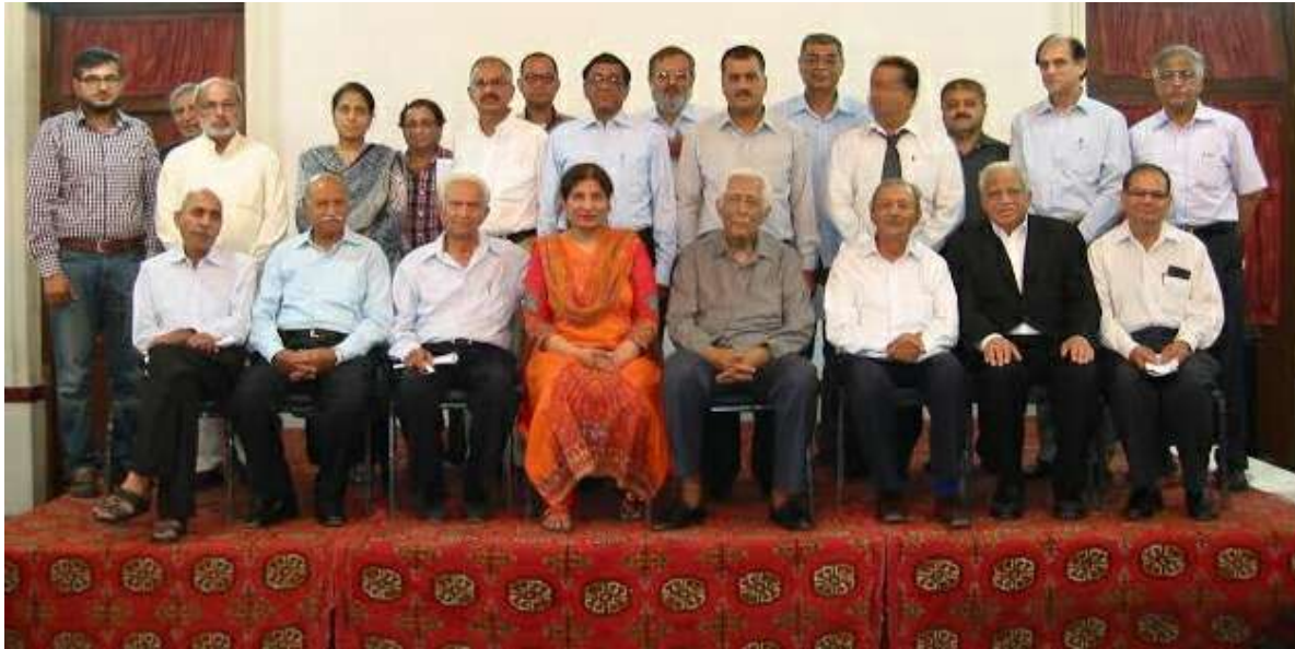
photo of the general body meeting that formally endorsed the elections

The Biennial elections of the College of Family Medicine Pakistan 2014-2016, took place on 21st August 2014 and were endorsed by the General Body of College of Family Medicine Pakistan as per the constitution on 6th Sept. 2014. Those elected were: